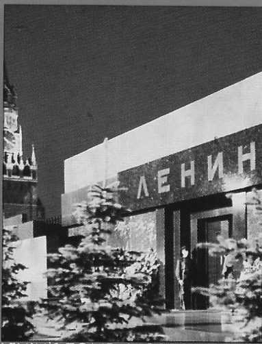
LENIN'S TOMB, MOSCOW