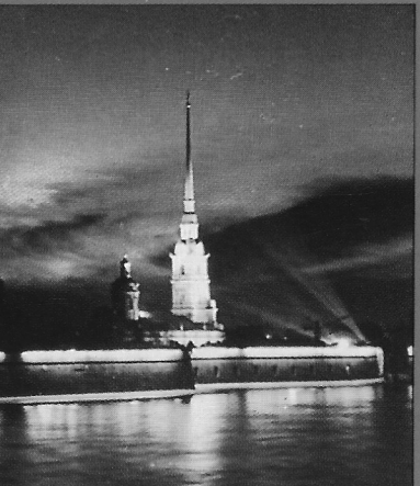
PETER AND PAUL FORTRESS

As the world entered the final decade of the 20th century, our lives were awash with the sea of change and positive renewals on the planet. In April 1992, Gloriam Dei Cantores, a Cape Cod Massachusetts based choir, will depart on their second gateway tour to Russia in cooperation with the Moscow patriarchate and Soviet ministry of culture. Again, this time, Gloriam Dei Cantores will bring a message of reconciliation and hope through the international language of music to Russia's beautiful and glorious capital, Moscow and, for the first time in 80 years the choir will be bringing sacred music by famous Russian and Western composers to the people of Siberia, the mystical little-traversed land.