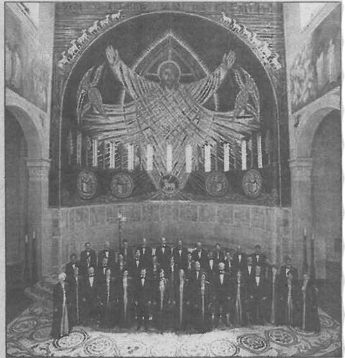
The choir in the Church of the Transfiguration, Orleans.

Mashpee Commons 6, 15 Steeple St., 508-477-7333. Call for shows and times.